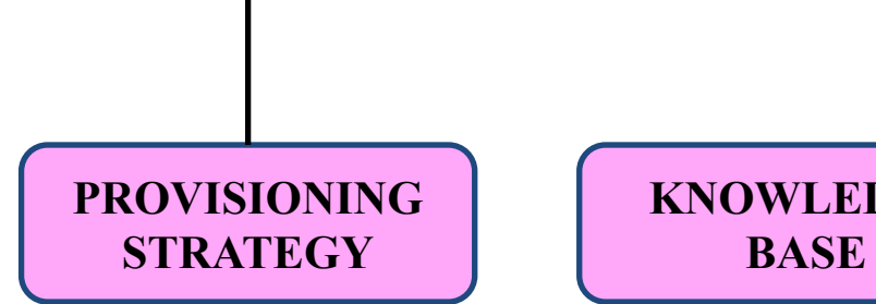
Fig 2: Data from Owner to Meta Cloud

Copyright to IJARCCE DOI 10.17148/IJARCCE.2015.44148